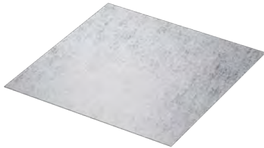
Geotextile Filter Sheet

Each VersiDrain® 150 v2 can be upgraded into a kit with these additional attachments.