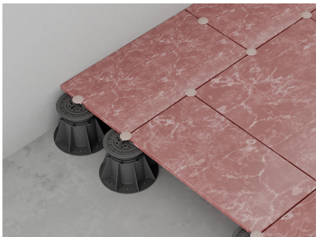
Stretcher Bond Layout