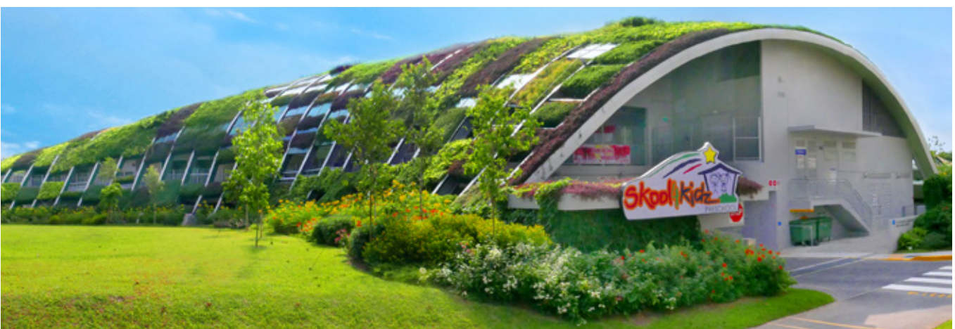
Skool4Kidz Campus, Singapore

Note: The information provided in this brochure is based on current knowledge and experience and does not infer any legally binding assurance or warranty, expressed or implied. Intending purchasers should verify whether any changes to specifications or applications or otherwise have been made since the issue of this literature. Environmentally-friendly recycled materials are used in product manufacture wherever possible. Physical product properties including colour may differ due to source of raw materials used. Colour may also fade due to UV exposure. All components of the product are designed for specific application, design calculations and any variation and/or deviation therefrom shall be the responsibility of the specifier and/or user.