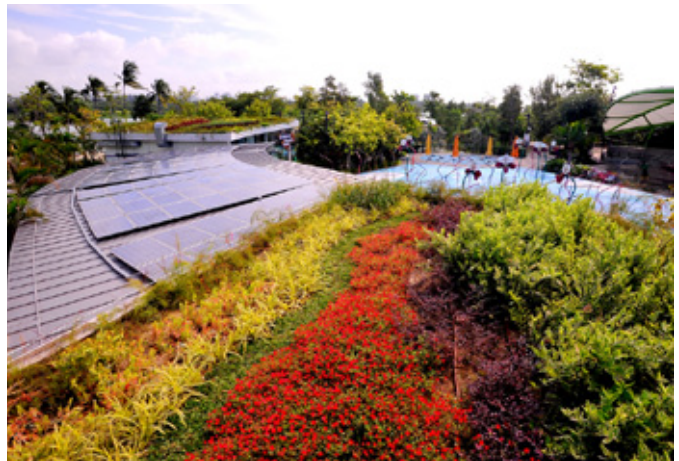
Gardens By The Bay, Singapore