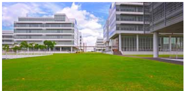
Fire Engine Access