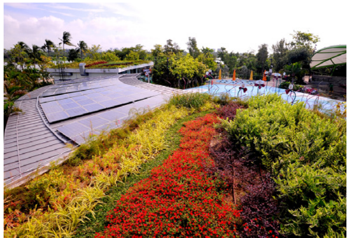
Gardens By The Bay, Singapore